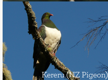
Kereru (NZ Pigeon)

This loop walk is generally an easy gradient on a grass track, with outstanding views of the Hauraki Gulf, beaches and regenerating bush. The track includes access to Ocean Beach, Snapper Bay, Calypso Bay and views over Ohinerau Bay. There are some marked Link tracks off this track which provide quicker routes to other destinations. Depending on wind direction it is always possible to find a sheltered beach for a picnic.